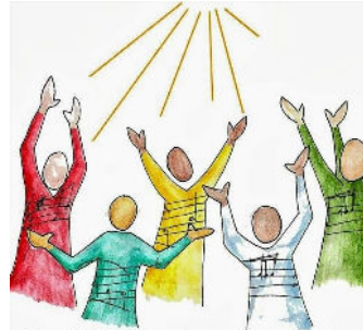
The LORD is my strength and song.

https://theprayerpocket.com/pentecost-prayers/ (Edited)